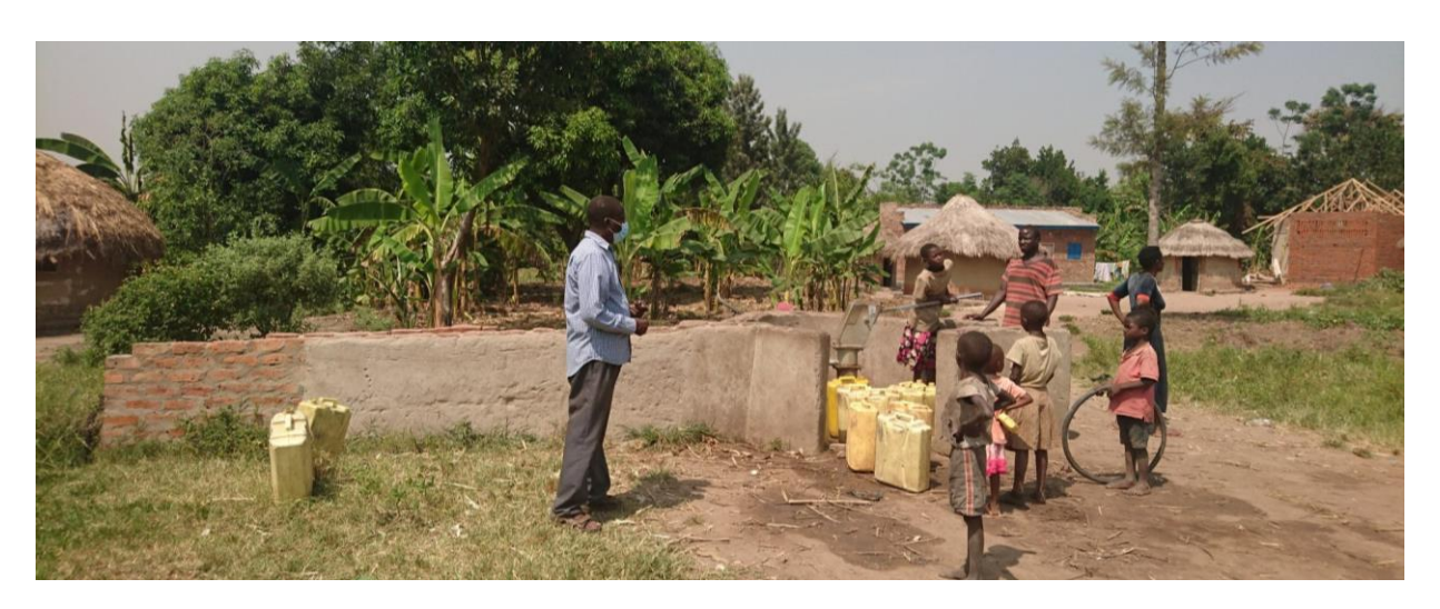
CO2balance colleague engages with community members to monitor the functionality of the borehole in Muhira

To date, CO2balance have rehabilitated 70 boreholes in Kaliro in Uganda and continue to successfully work with government officials to deliver project activities. As a government official in a developing country, we are interested to hear the Environment Officer's attitudes and thoughts about climate change.