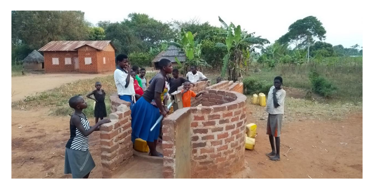
Community members gather around the borehole in Buhoya to collect safe clean water

A key concern is to integrate climate change issues in their routine planning for development and education.