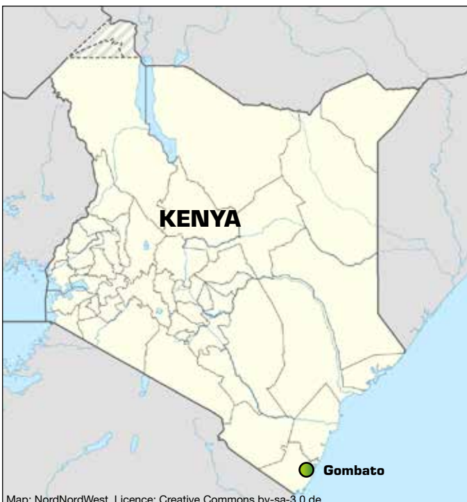
Map: NordNordWest, Licence: Creative Commons by-sa-3.0 de

We followed Mercy to Gombato Location. The village is semi urban with many multiple family homesteads. This means you can find anything between one and six families living in the same compound. Many families have moved to locations like this and set up homes as it is closer to the towns providing more opportunities of employment. Gombato, like most villages along the coast suffers from poverty, unemployment, poor hygiene and health problems as well as food security problems. Periodic, infrequent rainfall means that the land is not always fertile for crops. The climate and temperature makes many of these villages especially susceptible to Malaria and other water borne diseases. There is no electricity or fresh water source in Gombato. Despite the terrible conditions here, the villagers were smiling and welcoming. Walking through Gombato we were greeted by many women and children who were all familiar with the CarbonZero stove projects. They welcomed us into the community and all had positive things to say about the project. We went with Mercy as she entered various households and talking to people about their experiences with their new stove.